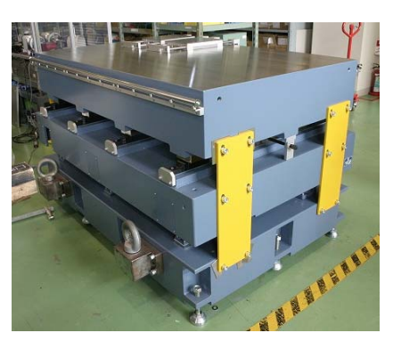
<Prototype : KCS-10 >

The firm structure allows for many variety of measurements. You can easily make a component changing and a fast measurement.